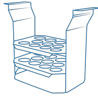
TR-30/13 BS-010406-IK rack

Test tube rack for \varnothing 16 to \varnothing 19mm tubes, capacity 16 tubes