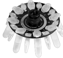
R-2/0.5 BS-010205-CK rotor

Rotor for 8 x 2/1.5 ml and 8 x 0.5 ml microtest tubes